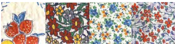
Images of Flour Sack patterns.

Lots of books and images on the subject — check the internet.